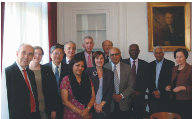
The FIGO Ethics Committee at their meeting in Paris in October, 2008 to which IFFS was invited to see how an Ethics Committee functioned

located according to subject matter to each of the editors to analyse the data and write a commentary. The objective is to have the material ready for presentation at the IFFS Munich Congress next year. At that time it will become generally accessible on the IFFS website. The document, published every three years, has become an important resource for clinicians and researchers who want to ascertain details of the workings of ART governance in other countries. It also serves as a record of changing trends in the field and acts as a stimulus to many to see how other countries react and regulate this ethically contentious field. On the last occasion, in 2007, data were obtained from 58 countries and it is hoped that many more will be able to respond for this edition. We are aiming to contact more than 100 countries, to give an even broader picture of the state of ART regulation throughout the world.