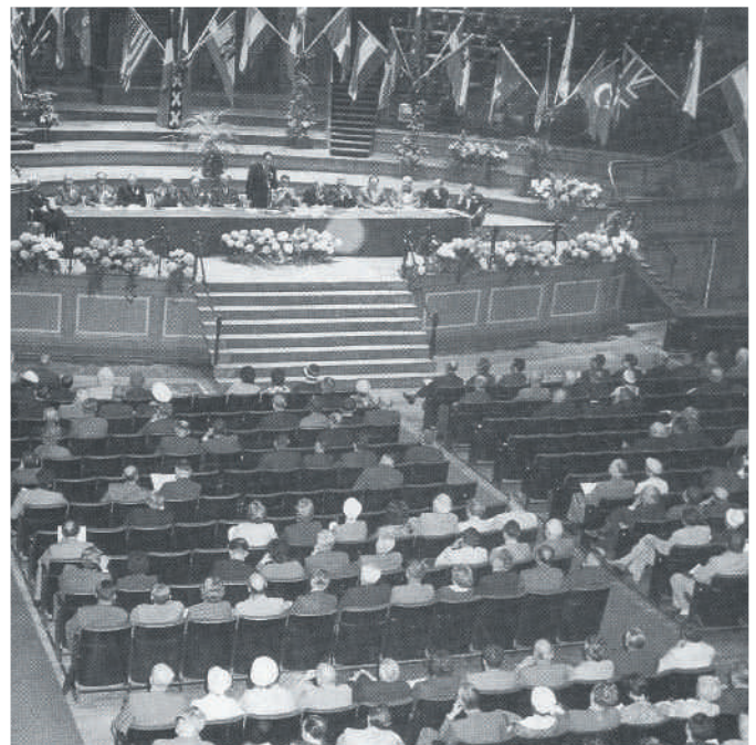
▲ III. World Congress of IFA, June 7—13, 1959, Amsterdam/The Netherlands, the opening ceremony.

The following year, on July 15, 1999 under Re-stated Articles of Incorporation, the IFFS was granted 501 (c) (3) status with exemption from federal income tax as a charitable organization. The final determination letter confirming this was dated January 18, 2000. Although the IFFS is required annually to report its financial activities it is not subject to federal taxes.